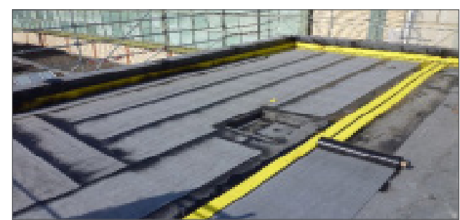
Simple sandwich installation between two geomembranes

ProEXP and FlamLINE can be incorporated into bituminous systems, including hot melt. Depending on the installation scenario, ProEXP and FlamLINE can also be applied with epoxy resin adhesive.